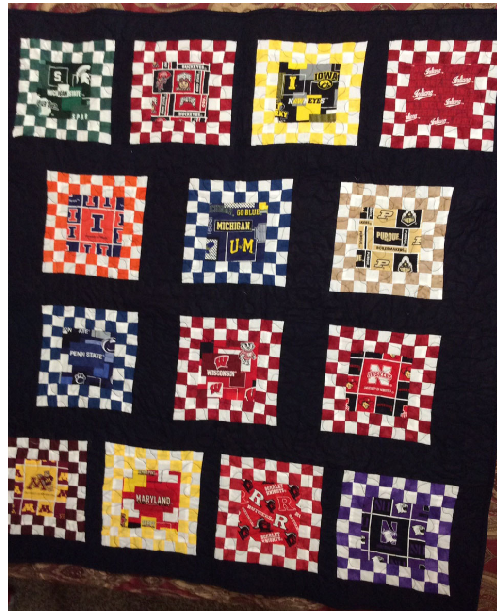
See how you can enter into a drawing to win this quilt on page 6.